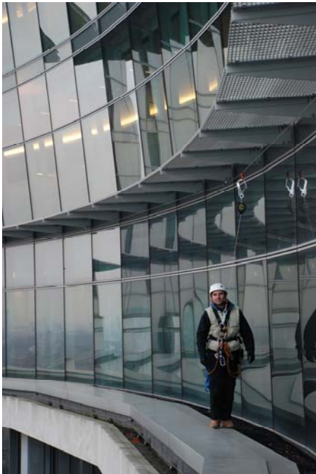
Completed fall protection safety line system.