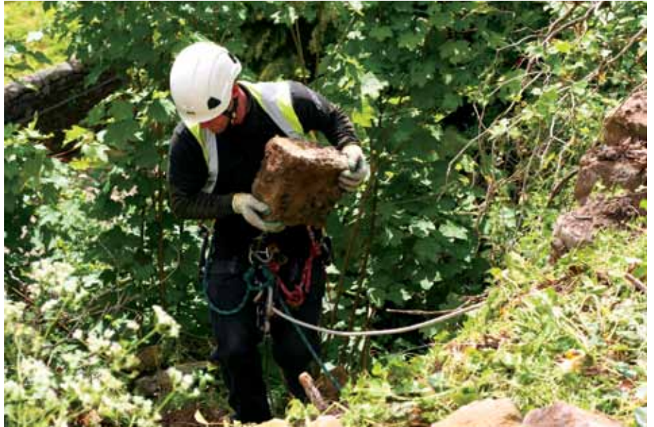
Vegetation removal - cliff-edge