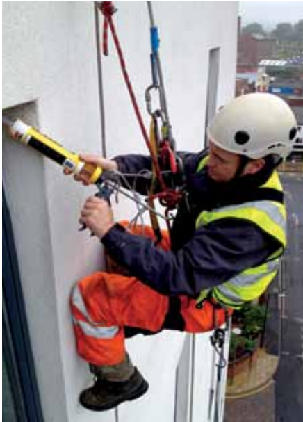
Glazing repairs - high-rise building building