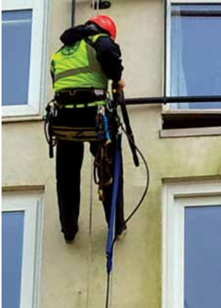
Hotel façade cleaning